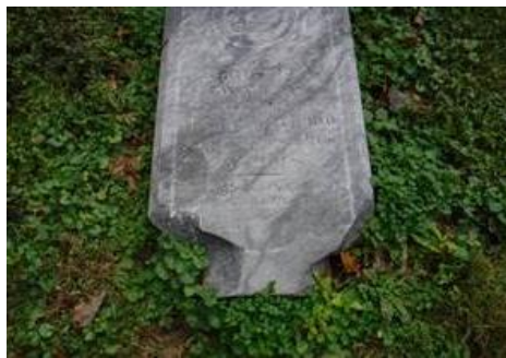
Headstone Flat on Ground