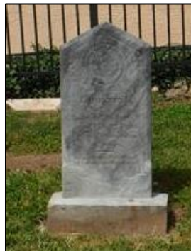
Same Headstone Repaired