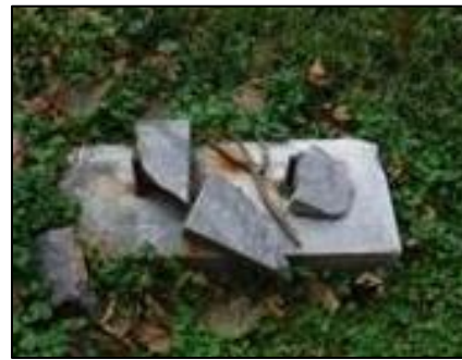
Broken Pieces of Same Headstone