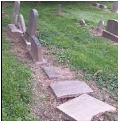
Row of Broken Stones Before

Finally in May 2021, we were able to get a number of tombstones repaired! See pictures below.