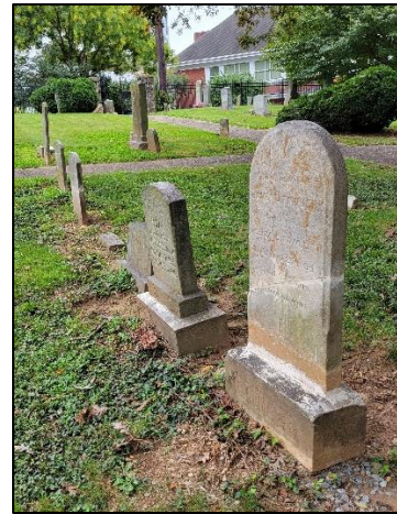
Row After Repair